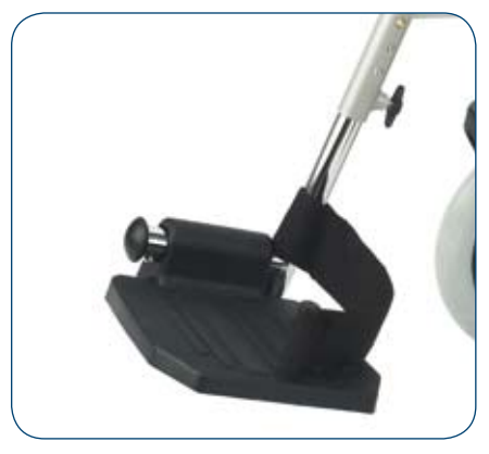
Practical leg length adjustment system with knob. Footrest with composite folding footplates and heel loop.