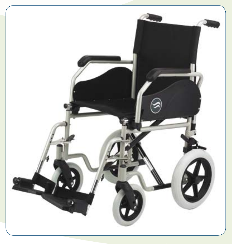
Breezy 90 with 12" rear wheels.

Just select the size of the rear wheel and seat width to determine the model of your Breezy 90.