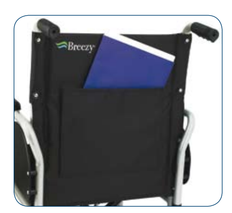
Nylon backrest covers the back tubes for increased confort, with rear pocket.